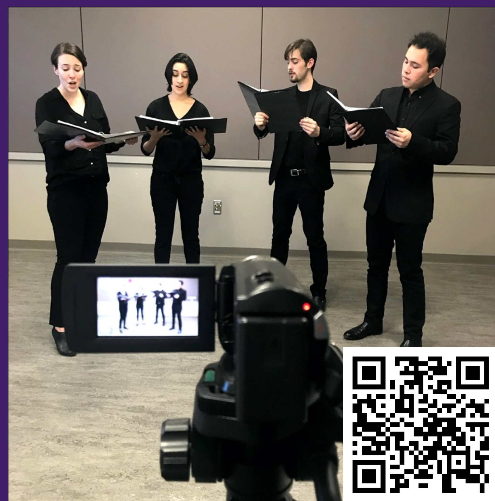
Vocal Quartet Video Stimulus